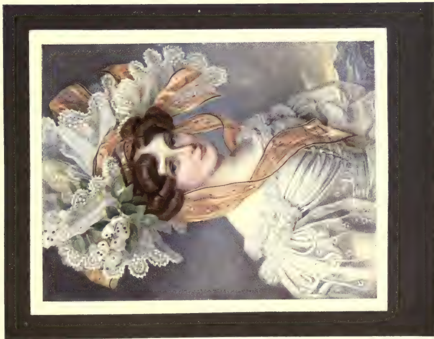
PORTRAIT OF A LADY—NAME UNKNOWN BY EMANUEL PETER